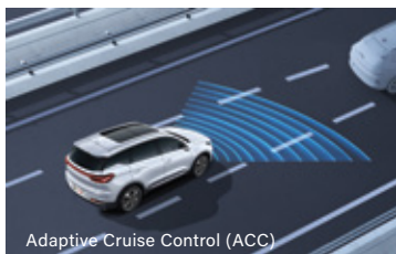
Adaptive Cruise Control (ACC)