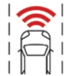
Lane Departure Prevention (LDP)