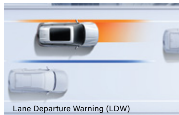
Lane Departure Warning (LDW)