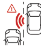
Door Opening Warning (DOW)