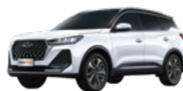
Khaki White with Black Roof