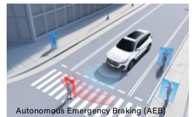
Autonomous Emergency Braking (AEB)