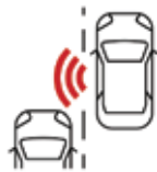
Blind Spot Detection (BSD)