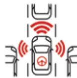
Traffic Jam Assist (TJA)