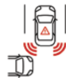
Rear Cross Traffic Alert (RCTA) Rear Cross Traffic Brake (RCTB)