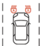
Intelligent High Beam Control (IHBC)