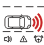
Integrated Cruise Control (ICC)